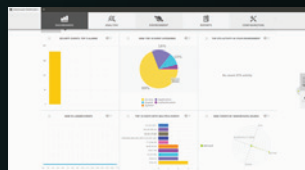
▲ OSSIM Integration

It provides a standardized nbsyslog output, using an RFC3164 / RFC5424 compatible syslog feed over TCP/IP.