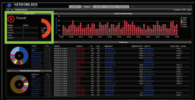
▲ Firewall Overview Screen

Each overview screen now has a health indicator at the top left to give you an at-a-glance summary of the status.