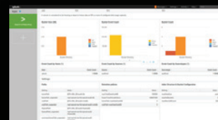
▲ Splunk Integration